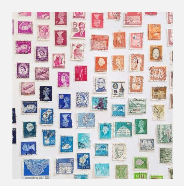
Stamp collectors are known as 'philatelists'.

For example, some people collect stamps (a philatelist), teddy bears (an arctophile), stationery items, records (a discophile), books (a bibliophile), keyrings (a copoclephile), shells (a conchologist), the list is endless!