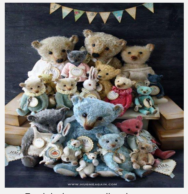
Teddy bear collectors are known as 'arctophiles'.